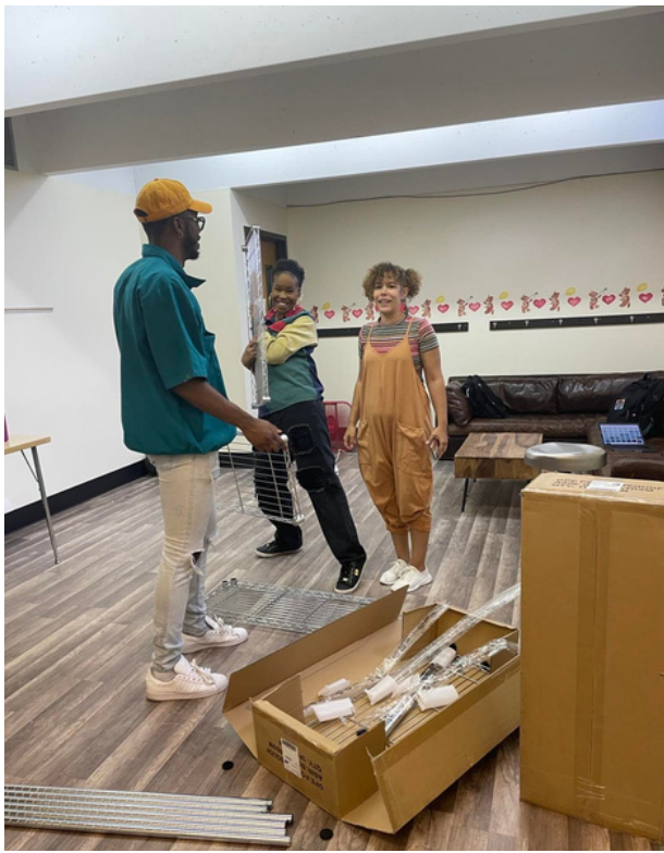
MIA STAFF MOVES IN AND GIVES ROOM 10 A FRESH LOOK