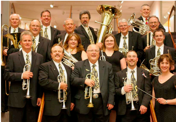
The Jeffco Brass returns on July 13th